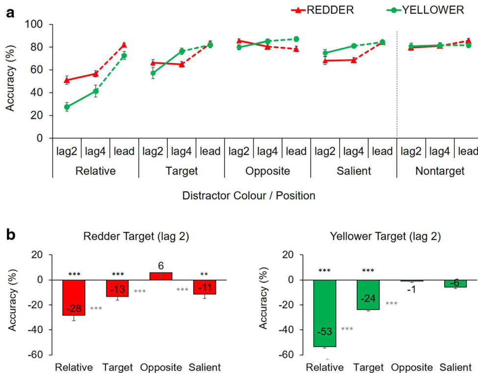
Fig. 2 a The mean target accuracies depicted separately for the two different target conditions (redder, yellower), distractors, and target-distractor lags. An AB, reflected in an impairment in performance at Lag 2, was evident for relatively matching distractors, target-similar distractors, and, to a lesser extent, for the salient green distractor. b The AB at Lag 2, computed as the difference value to the no distractor (at Lag

2); separately for the redder target (left) and yellower target (right), showed a significantly larger AB for the relative-matching distractor than for the target-similar distractor, which in turn had a larger AB than the opposite distractor. Error bars depict \pm SEM and may be smaller than the plotting symbol. *** p < .001 ; ** p < .01 . Black asterisks show a significant AB; gray asterisks significant differences between conditions